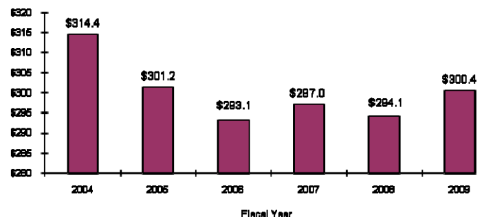
State and Local HIV Prevention Cooperative Agreement Funding FY2004-FY 2009